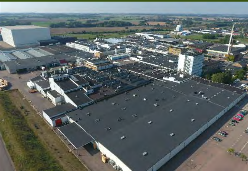
A close up view of the entire industrial complex now owned by FoodHills AB, The company that took over Findus Sverige AB on March 1, 2018