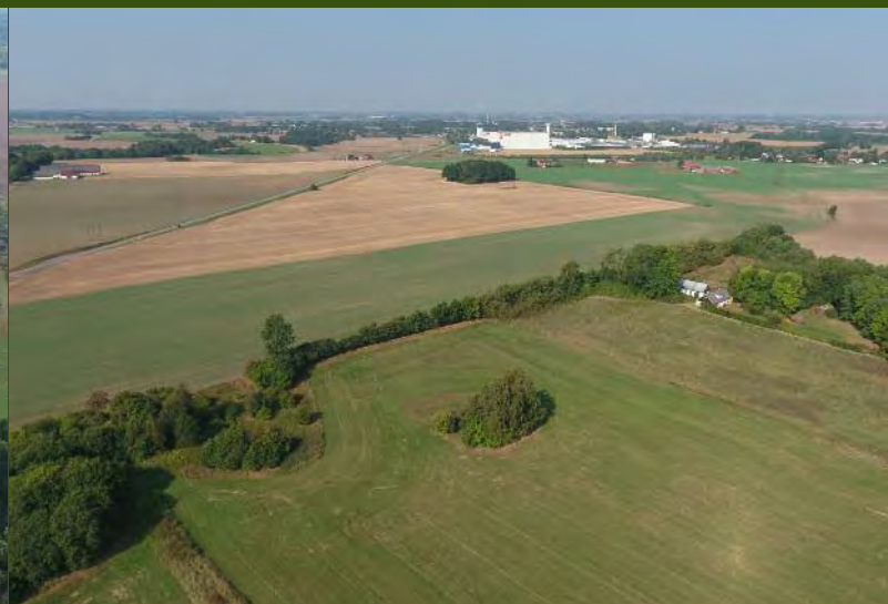
View of the landscaping constituting potential areas for the establishment of new industry of fish and vegetables in Bjuv, Photo: Bengt Fellbe

and Educator in close cooperation with industry. Bjuv municipality is a project participant ( http://www.climate-kic.org/events/open-innovation-urban-food-from-residual-heat/ ) in an innovation contest sponsored by Vinnova, see article about the Innovation Contest in this eBook, which aims at utilizing the residual flow for community development in urban environments. Through our municipality's high activity and presence in projects linked to sustainability, we are now also project participants in the Interreg project UBIS – Urban Baltic Industrial Symbiosis. It is an EU project focusing on Industrial symbiosis with participating countries around the Baltic Sea. Last but not least, SSEC and stakeholders connected to the network played a decisive role in the municipality of Bjuv when Nomad Foods decided to close down Findus AB in Bjuv. Through members of SSEC with high competence and high levels of business credit, a belief among entrepreneurs and investors was established for a new food industry in Bjuv, which has now also become reality through the acquisition by FoodHills AB. In addition to this, we have had a large exchange of experience and expertise through the other members, as well as the opportunity to get in touch with potential new