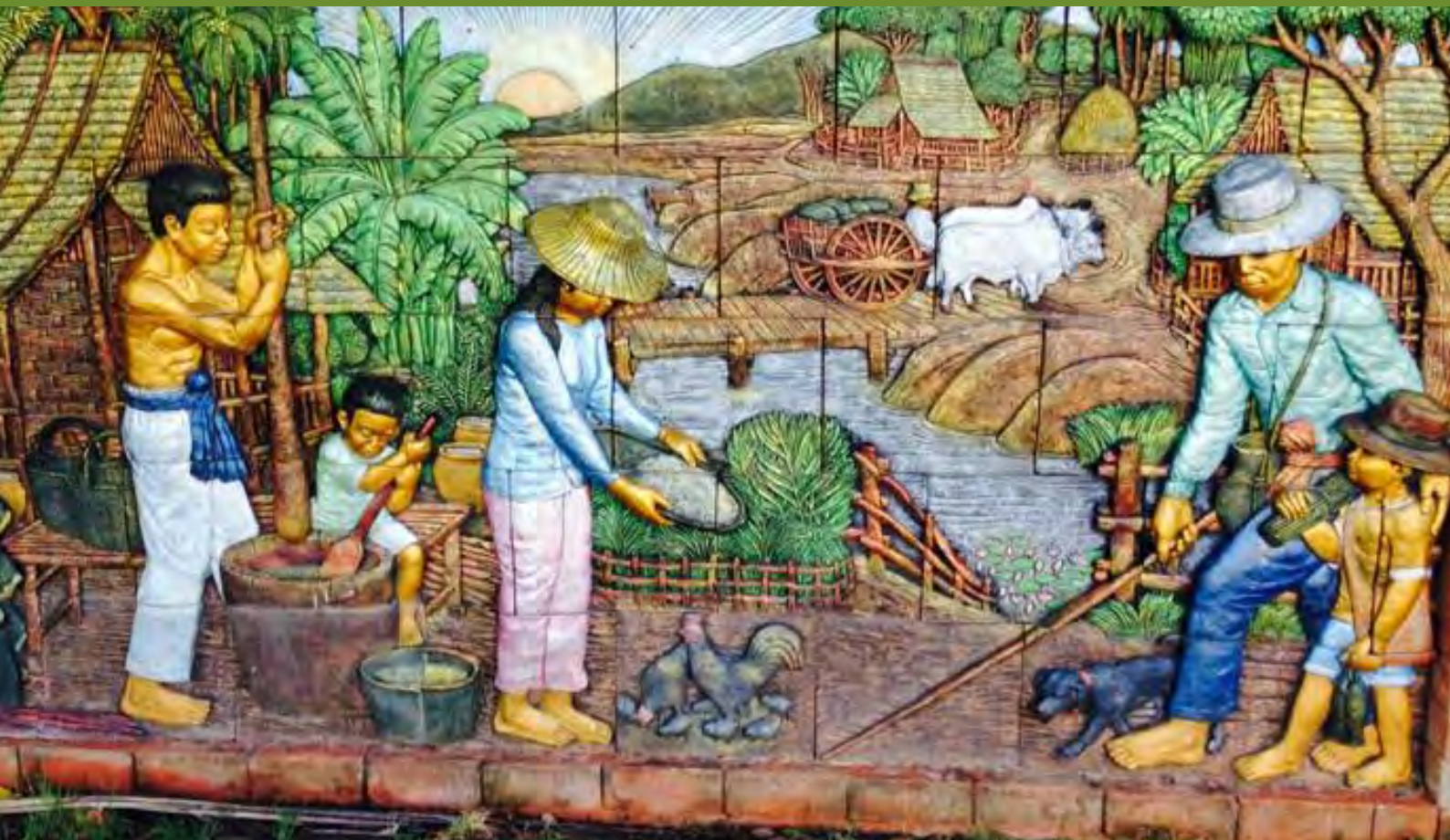
Photo by Håkan Sandin att King Naresuan Court outside Nakhon Ratchasima, Thailand: A pastoral dream landscape in Thailand today replaced by a highly efficient industrial agriculture that, with the help of chemicals and fertilizers, destroys a millennial agricultural ecosystem.