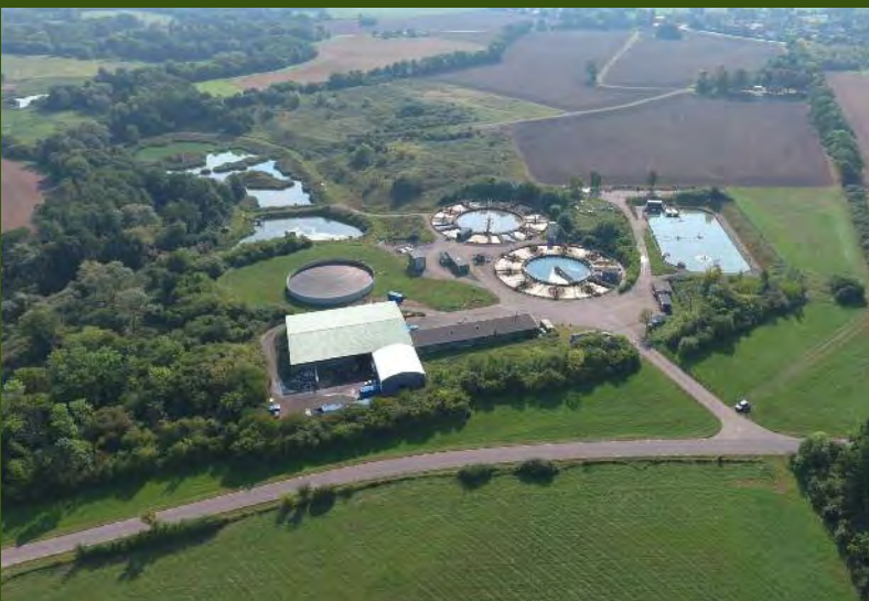
View of the industrial process treatment plant in Bjuv, Photo: Bengt Fellbe