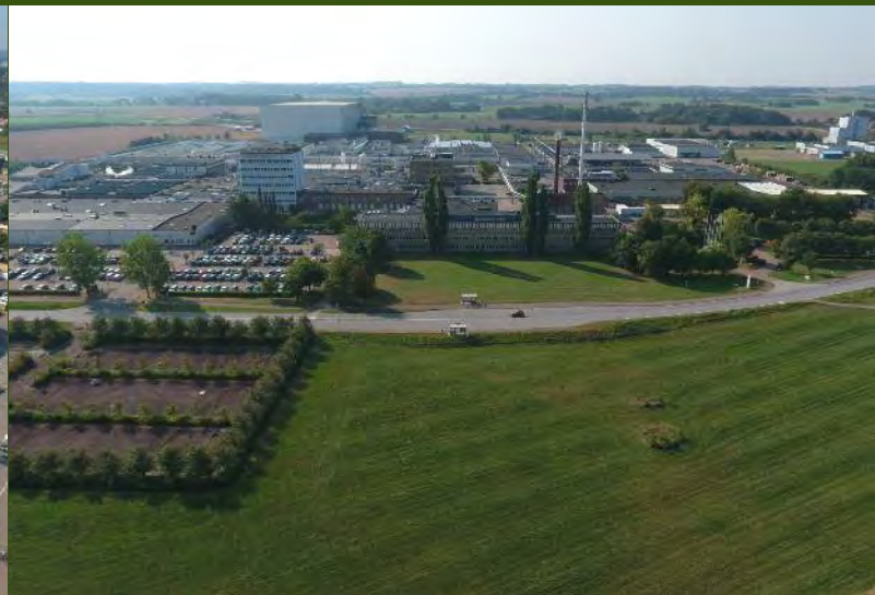
View of the entire industrial complex now owned by FoodHills AB, The company that took over Findus Sverige AB on March 1, 2018

work on the municipality's future location advantages. We already knew that we have an exceptionally good geographical-logistical location, with well-developed infrastructure, which provides access to both the major Swedish cities in the north as well as parts of Europe in the south. In order to make a long story short, the work was based on the fact that, in addition to its geographical location and good infrastructure to large markets, Bjuv has very good access to sustainable energy, experience and expertise in industrial symbiosis through co-operation between companies to engage in a circular and sustainable production, as well as infrastructure and large land areas that are particularly suitable for modern sustainable food industry and cultivation. It started with a collaboration called "Söderåsen Biopark", which later on developed to be "Food Valley of Bjuv" - a cluster for sustainable, mutualistic and circular food industry with associated research and development.